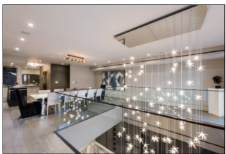
357 West 17th Street